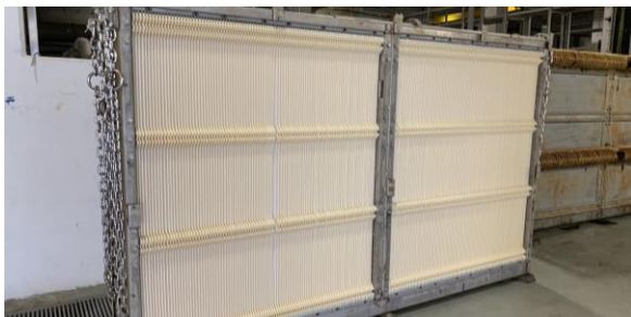
Membrane Module 膜组件