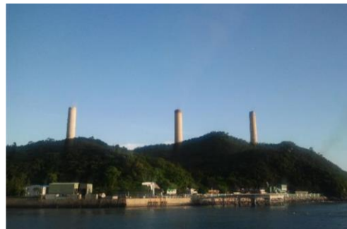
Yung Shue Wan WWTP, Hong Kong, China 中国香港榕树湾污水处理厂 8,550 m 3 /d