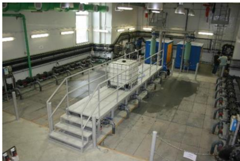
Lo Wu Correctional Institution WWTP, Hong Kong, China 中国香港罗湖惩教所污水处理厂 775 m 3 /d