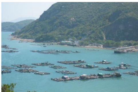
Sok Kwu Wan WWTP, Hong Kong, China 中国香港索罟湾污水处理厂 4,290 m 3 /d