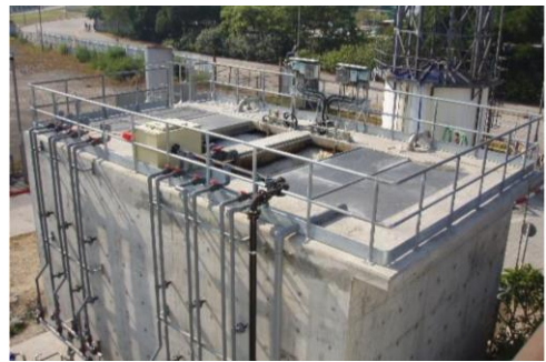
Airport Authority WWTP, Hong Kong, China 中国香港机场管理局污水处理厂 800 m 3 /d