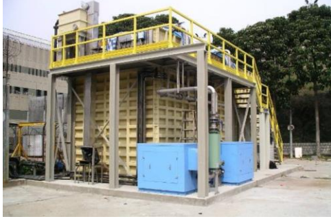
Tai Lam Correctional Institution WWTP, Hong Kong, China 中国香港大榄惩教所污水处理厂 340 m 3 /d